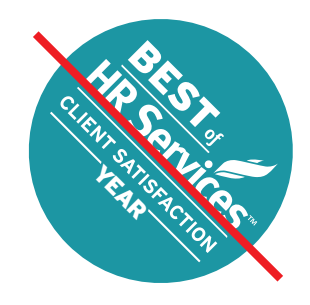
DON'T rotate the award badge.